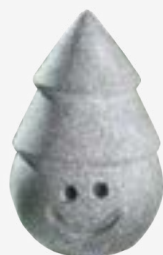
Jolle ø 86 x 79 11036