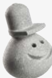
Reiska ø 46 x 63 11028