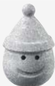
Sulo ø 45 x 70 11040

Place the Sauna Elf on the sauna stove to enhance the atmosphere with happiness.