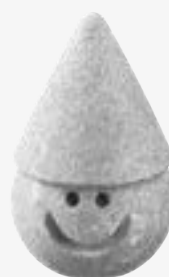
Tahvo ø 45 x 72 11022