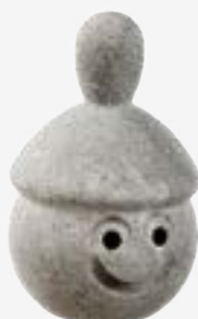
Elli ø 45 x 71 11024