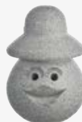
Lyyli ø 45 x 65 11031